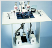
MANIFOLD AND COMPLETE PUMPING SYSTEM 全套收管真空设备